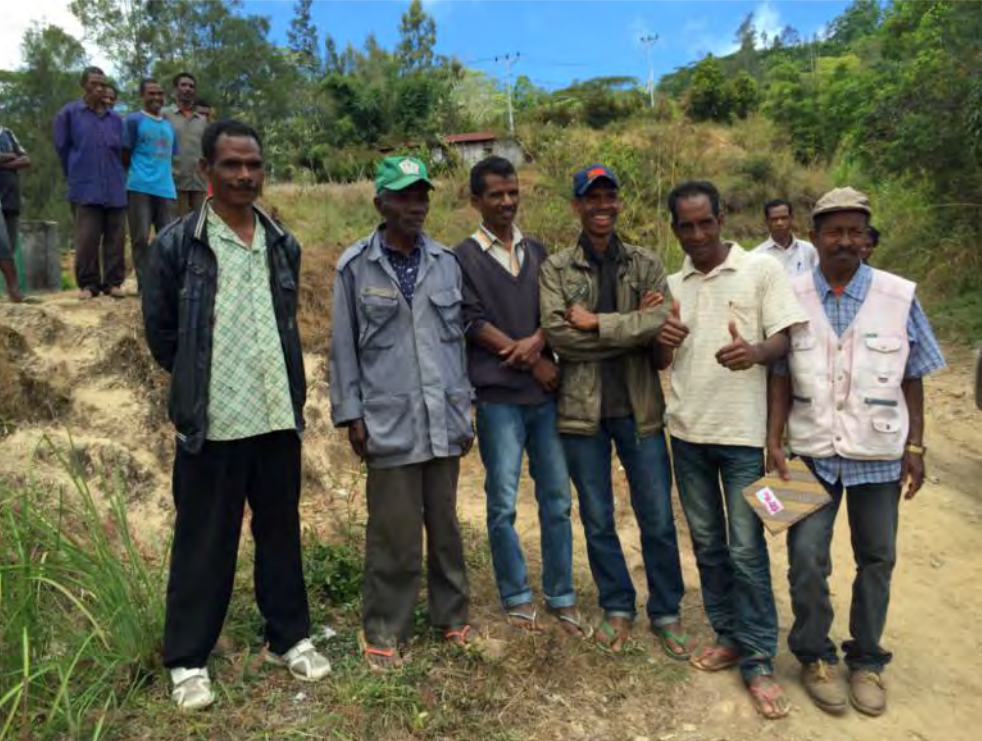
The maintenance team that TLV is training to regularly monitor the water system.