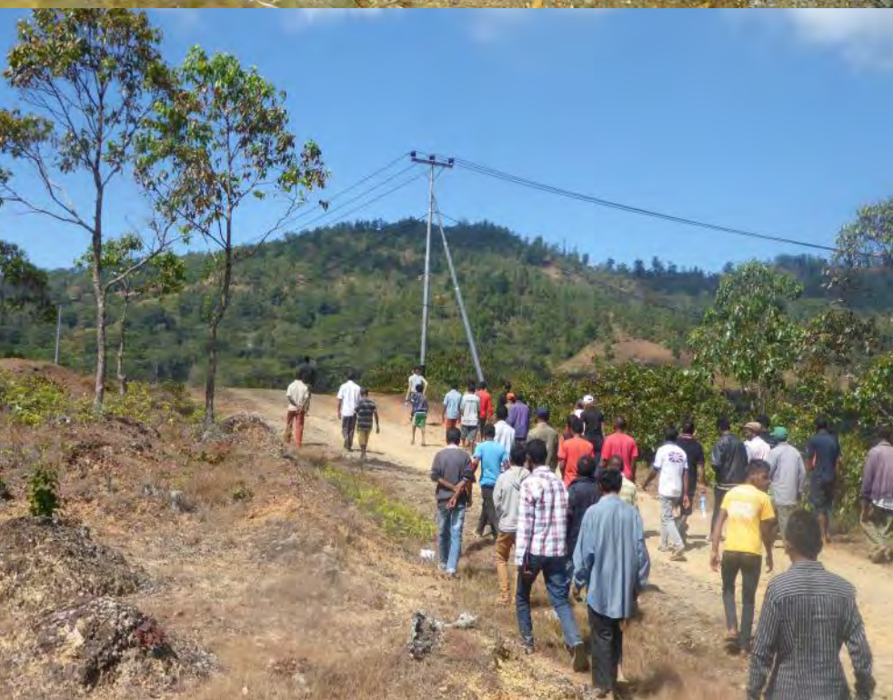
The walk to the water source an hour away!