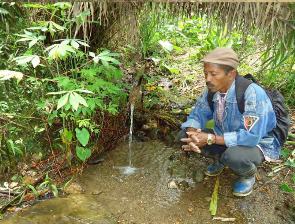
The water source